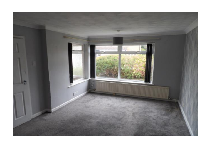
Clarkson Road, Oulton Broad Lowestoft NR32 3NU

A 2 bedroom detached bungalow situated in North Oulton Broad. The property comprises: Entrance porch, entrance hall, lounge, kitchen, 2 bedrooms, wet room, gas heating to radiators, double glazing, detached garage and gardens